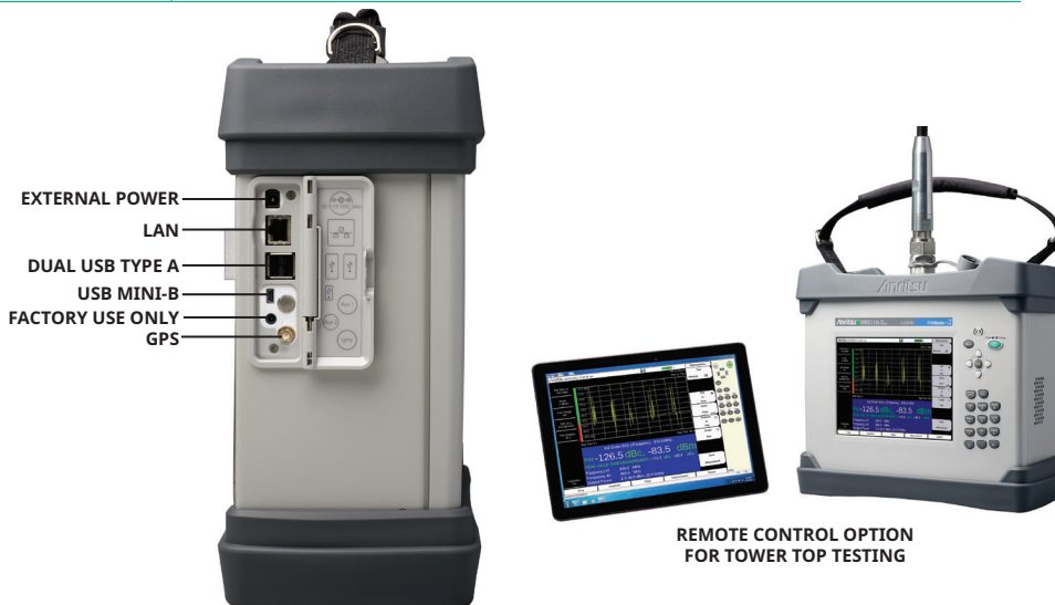
CONNECTOR PANEL ON LEFT SIDE OF MW82119A