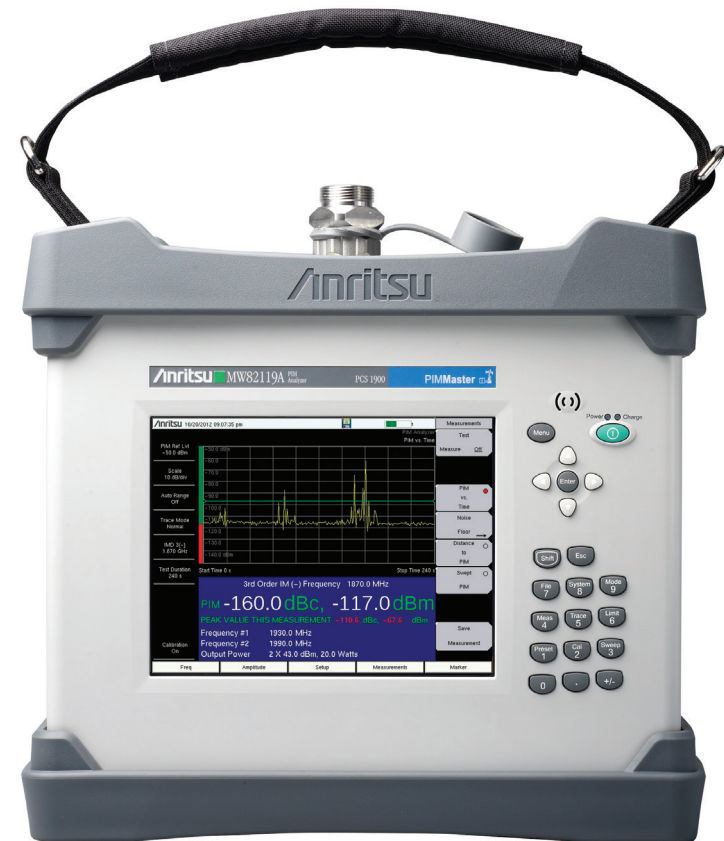
PIM vs. Time PIM Level (dBm) vs. Time (s)